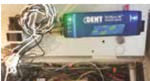
Power meters installed on heat pumps, independently monitored by DCSEU.

The DCSEU team worked independently from the Honeywell team, metering these same test rooms. Their results were reported to Hilton and Clearview independently from and in addition to the EMS data from Honeywell.