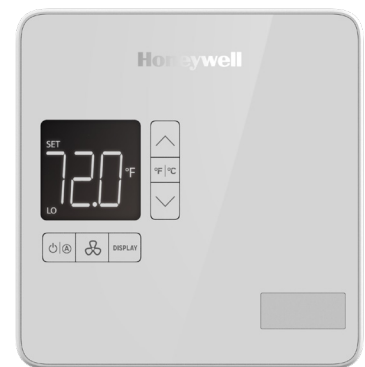
INNCOM D1 Thermostat with motion sensor