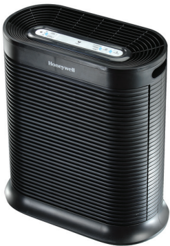
Honeywell HPA300 true HEPA air purifier

Bring guests back with the safety they’re seeking