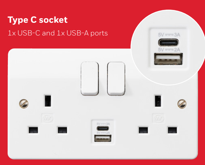
Logic Plus<sup>™</sup> - White (also available in Logic Plus graphite finish)