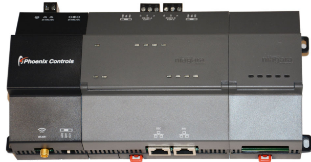
PCI8000 with Communication Module

The Test and Balance (TAB) feature is also a set of web pages that is used by third party verification experts to measure all airflows to ensure valves are flowing as intended. The TAB function can place several spaces in full heating or cooling so the balancer can check out the hot water and air handling systems. Balancers can enter the measured field data for adjustments and save the data in a .csv format for use in their own reporting tool.