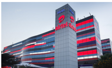
Airtel Centre, Gurgaon