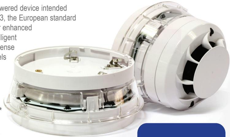
* Detector purchased separately

KAC's EN54-23 Detector Base Sounder Strobe is a high quality loop powered device intended to alert building occupants of a potential fire. Approved to meet EN54-23, the European standard for Visual Alarm Devices, it utilizes the System Sensor B501AP base for enhanced installation flexibility and integrates seamlessly with System Sensor intelligent detectors. When triggered by the fire panel, its powerful sounder and intense strobe give a visible and audible warning. A choice of sound output levels and tones make the device suitable for a wide variety of applications.