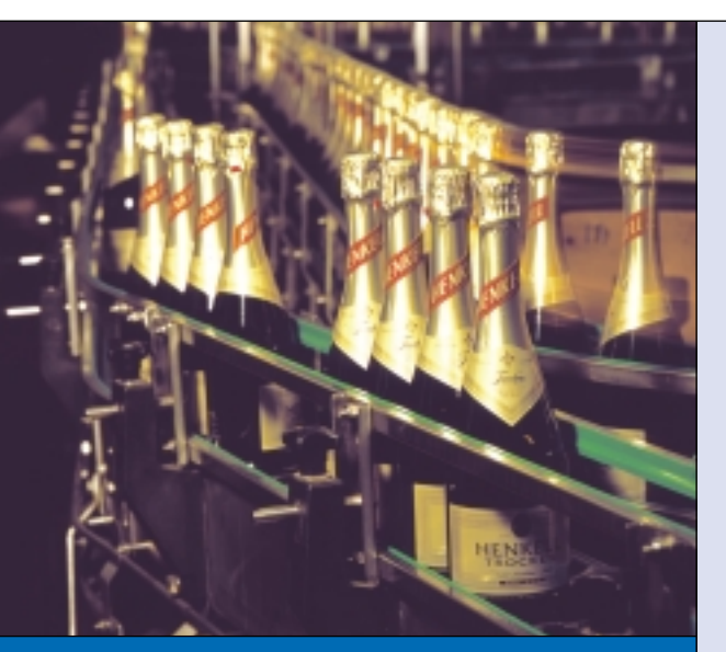
Sektkellerei Henkell & Co.

Protection is provided by comprehensive installations, consisting of one master control panel and five remote panels in the essernet® network. Multiple fire detection panels and one intrusion detection system are networked and connected to the multi-terminal WINMAG hazard management system. One WINMAG workstation is located in the porter's office and another one is located in the electrical shop, where the hazard management system is edited. On account of the vast premises, some control panels are networked with fibre-optic cables bridging greater distances than standard wiring techniques.