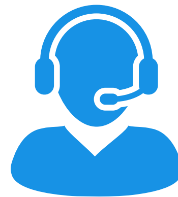
Air Traffic Controllers

Our designs regularly win international awards such as iF Design, IDEA, and Red Dot – but our most important achievements are the breakthroughs our customers achieve in their operations.