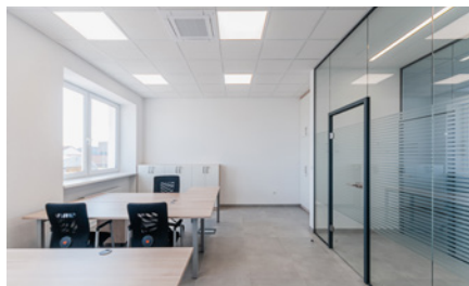
SMALL OFFICE SPACES