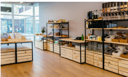
SHOPS AND SMALL RETAIL CHAINS