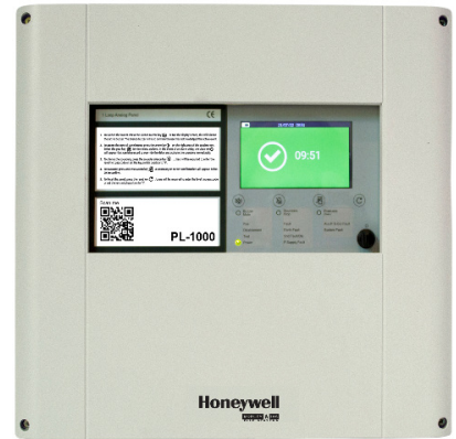
Morley-IAS Plus PL-1000

Due to its size and power, it is the ideal analogue addressable control panel for small to medium sites where maximum information is required from the installed devices. The control panel allows the identification of each of the intelligent sensors in order to verify the state of the system before carrying out any evacuation or transmission to the alarm receiving station, or to the building management system.