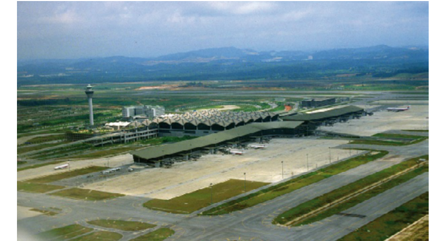
Kuala Lumpur International Airport, Malaysia