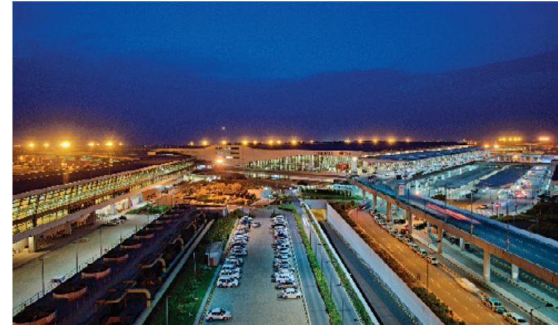
Indira Gandhi Airport, Delhi, India