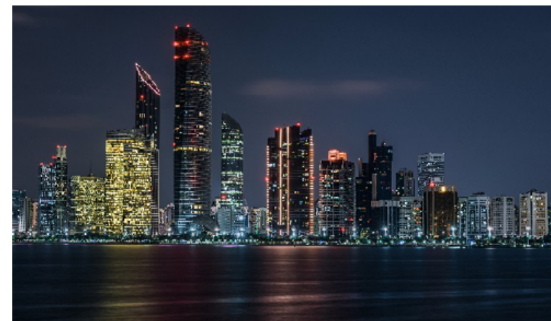
Abu Dhabi Airports Company, United Arab Emirates