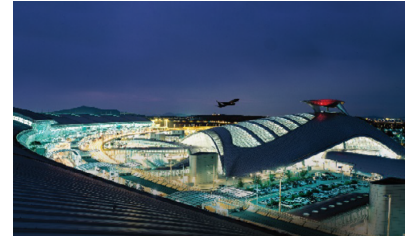
Incheon International Airport, South Korea