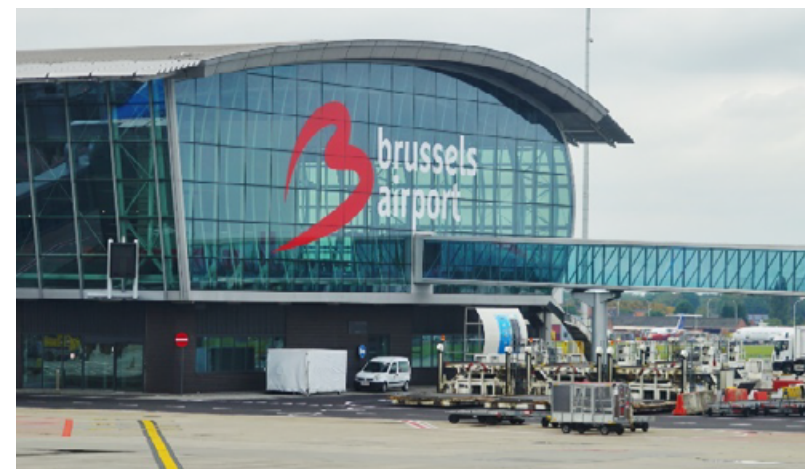
Brussels International Airport, Belgium