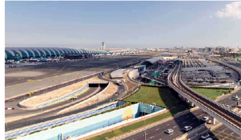
Dubai International Airport, United Arab Emirates

Honeywell empowers airports worldwide to reach optimized operational potential.