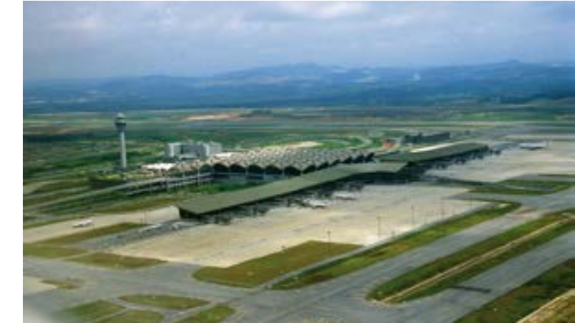
Kuala Lumpur International Airport, Malaysia