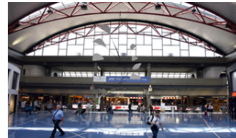
Pittsburgh International Airport, Pennsylvania, USA