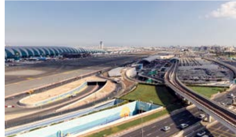
Dubai International Airport, United Arab Emirates

Honeywell empowers airports worldwide to reach optimized operational potential.