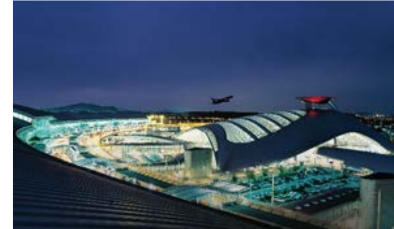
Incheon International Airport, South Korea