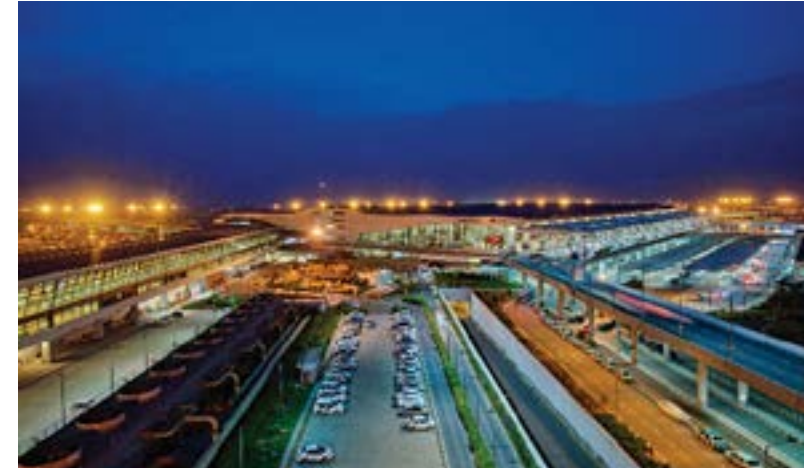
Indira Gandhi Airport, Delhi, India