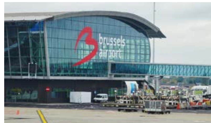
Brussels International Airport, Belgium