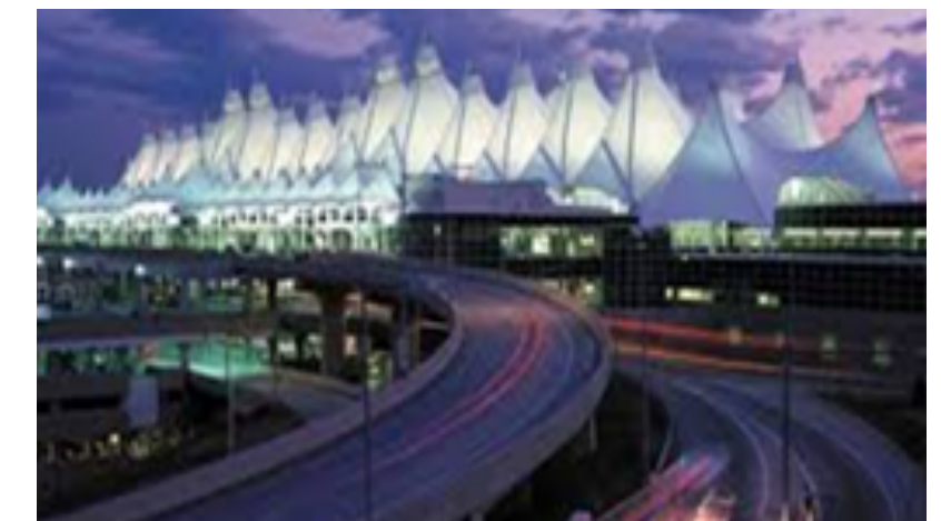
Denver International Airport Colorado, USA