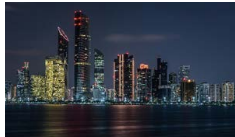
Abu Dhabi Airports Company, United Arab Emirates